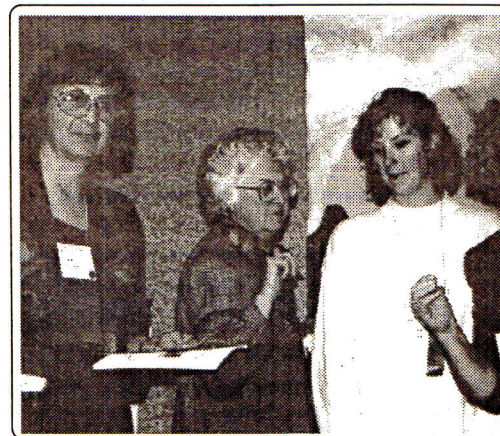
Planning Team Members—see names below