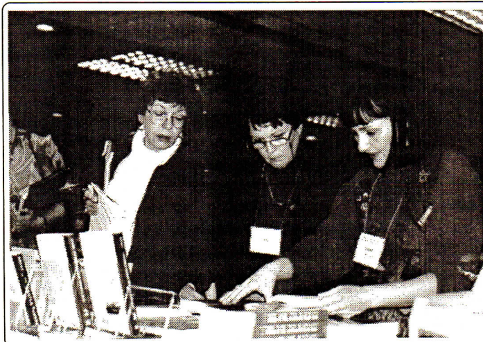
Conference Attendees Browse Exhibits

The Southern membership invited to this meeting. Find out what women making history are doing, and find out how you can participate in all the excitement. There will be a new member orientation at 10:30 a.m. See full information in previous column.