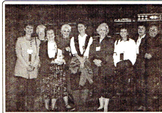
Las Vegas Attendees—see names below