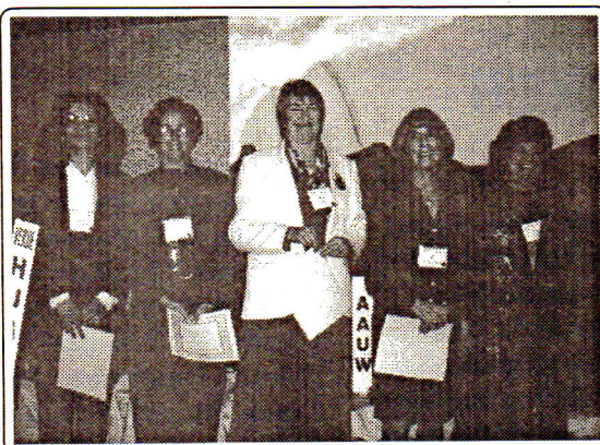
Roll of Honor Recipients--see names below